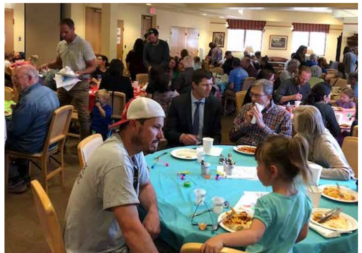
Pope Hall was filled with the laughter of children, great food, and opportunities to meet other parents of children in the Children's Development Center (CDC) during CDC's annual pasta dinner fundraiser.