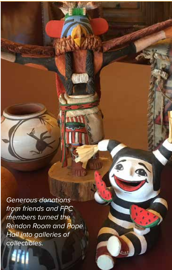
Generous donations from friends and FPC members turned the Rendon Room and Pope Hall into galleries of collectibles.