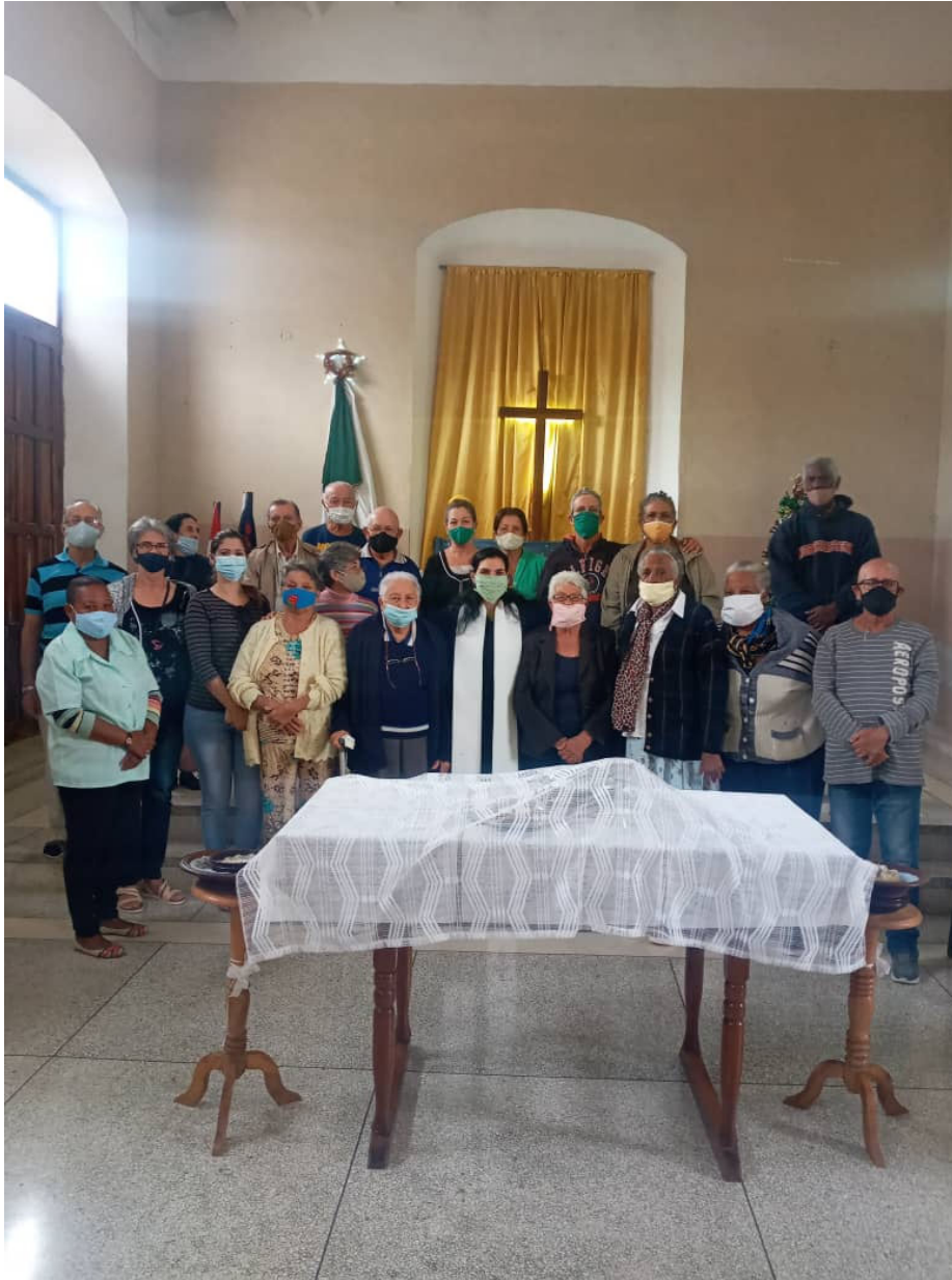
Christmas 2020 Greetings from Sagua La Grande elders to their friends at First Presbyterian Church of Santa Fe.

We do not know when trips to Sagua La Grande might resume. The pandemic was slow to reach the city due to a government lockdown last summer on travel between cities, but it is now spreading there.