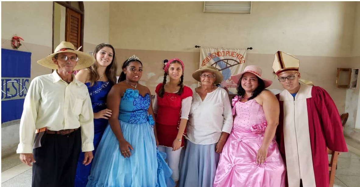
Sagua La Grande actors from a recent 2020 musical performance.

The poverty and the crumbling infrastructure throughout the country are disconcerting, but the people are remarkably proud and resilient. Medical care is quite good, though supplies and medications are scarce. All children and youth go to school, wearing uniforms. Most everyone is literate. The parishioners say they like to sing from their old hymnals, dating from the 1950s.