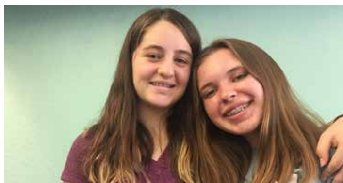
Celebrate God's love