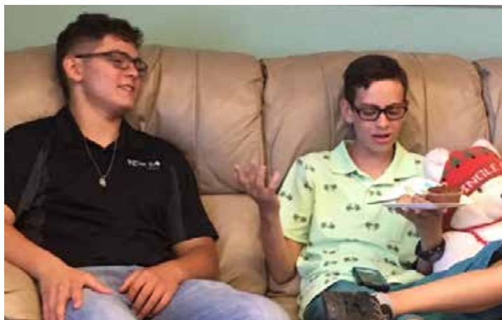
Add Bible study