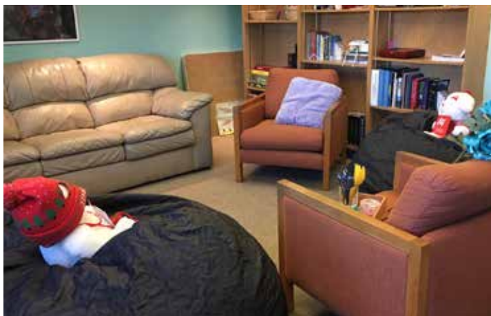
Take one spruced-up youth room